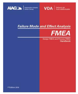
Fig. 1. New FMEA handbook elaborated by AIAG and VDA

Changes in the new handbook can partially be considered revolutionary (e.g. departure from the domination of RPN indicator). They are partially legitimization of good practices with regard to FMEA analysis, which are well-known to experienced moderators. This is the case with respect to defining failures and evaluating their effects.